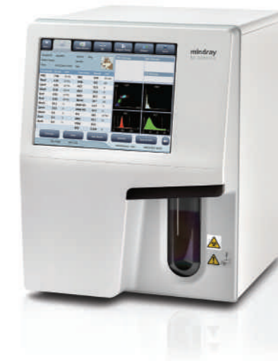
BC-5000 Vet Auto Hematology Analyzer

* Cow, Llama, Goat and Sheep will be ready in the December 2014